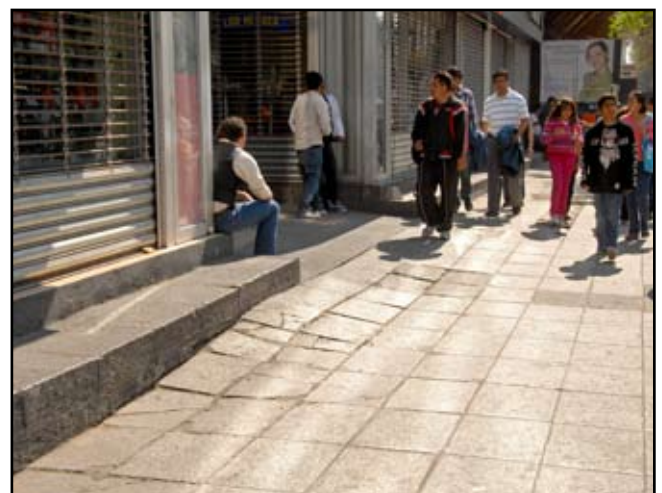
The subsided and distorted street pavement alongside the relatively stable Torre Latinoamericana.