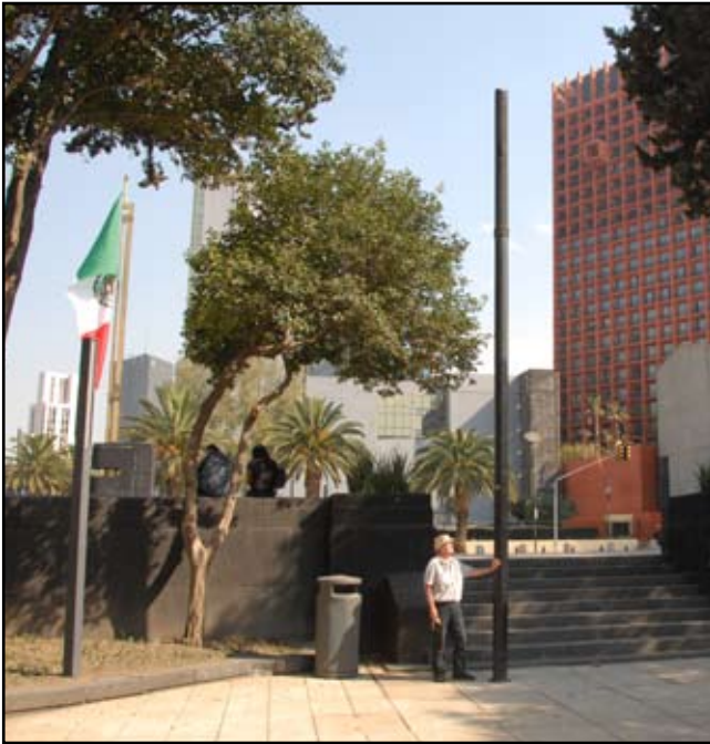
The protruding well casing in Plaza de la Republica.

The big problem therefore lies at depth, where sands interbedded with the clays have long been exploited for supplies of fresh water. Pumped abstraction of the groundwater has almost no impact on the sand aquifers themselves. But water pressures within the alternating sands and clays ultimately equalise, as water is squeezed out of the clays and into the partially drained sands. That loss of support by the pore water pressure causes the clays to compress under their own weight, independent of any imposed loads from buildings. The result is the regional ground subsidence that has caused the sinking of cities that stand on alluvial sequences, all across the world, famously including parts of Tokyo, Shanghai and of course Venice.