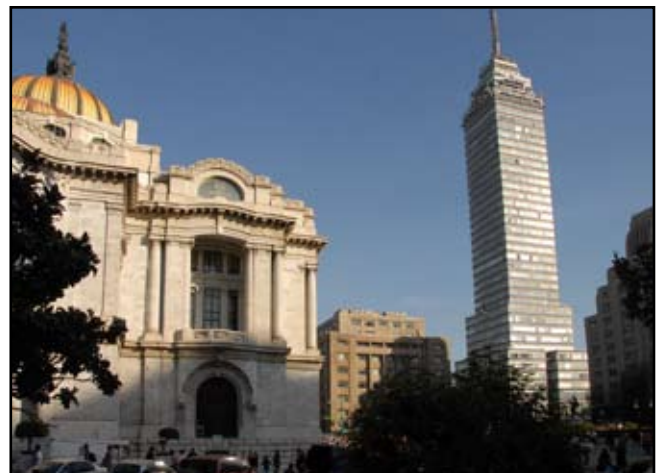
The Torre Latinoamericana rising beyond the profile of a corner of the Palacio de Bellas Artes.

Settlements of individual buildings are only part of the story, as the entire city centre has also subsided by many metres. This is due to compaction of the clays at depth where they have suffered major declines in pore water pressure. These highly compressible clays have a water content that is typically around 40%, and a significant part of the bearing capacity of the saturated clay derives from the natural water pressure in the pore spaces between the flakes of clay mineral. When this water is depleted, clay compaction and regional ground subsidence are inevitable.